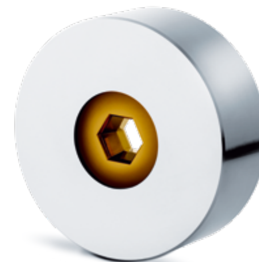
» CVD TiC/TiN