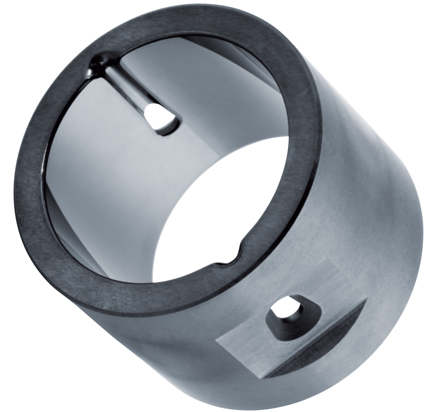
» PVD HardSilk®